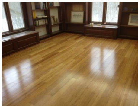
New flooring in the library

Some of the projects RCCL has sponsored included a new roof, building the garage, parking lot lighting installation, flooring in the library, office and apartment, interior painting and plumbing repairs to name a few.