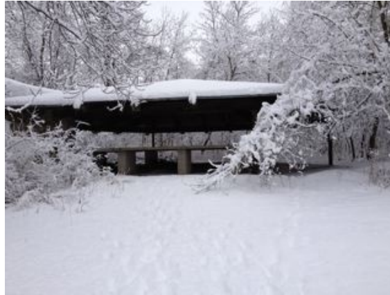
River Bend Pavilion

We couldn't do it without you! Our dedicated group of volunteers have logged over 4,800 hours since September to once again make River Bend an environmental education and outdoor recreation center the residents of Racine County can be proud of.