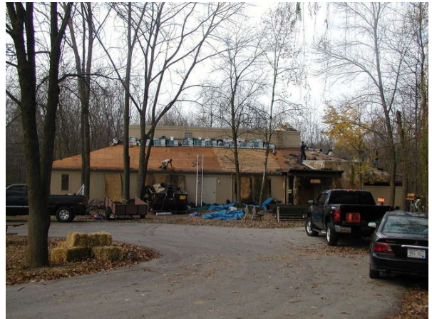
New roof installation on Main Lodge

RCCL has been a supporter of River Bend since 1982, with a donation to support a summer intern and purchase the movie “Maple Sugar Farmer”. Since the “reopening” of River Bend, RCCL has donated over $25,000 toward building repair, and has budgeted an additional $10,000 for 2013.